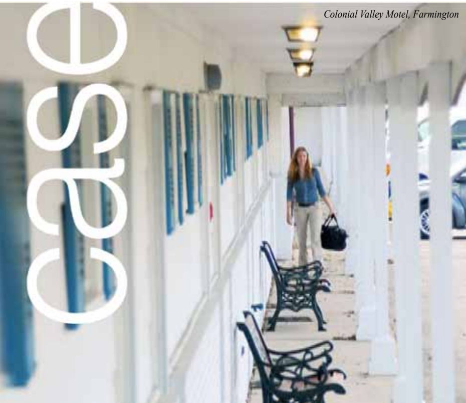
Colonial Valley Motel, Farmington