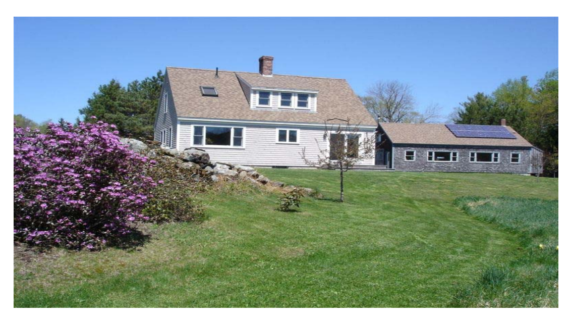
Solar electric system (2.38 kW), Hope ME. Installed by Energyworks of Liberty