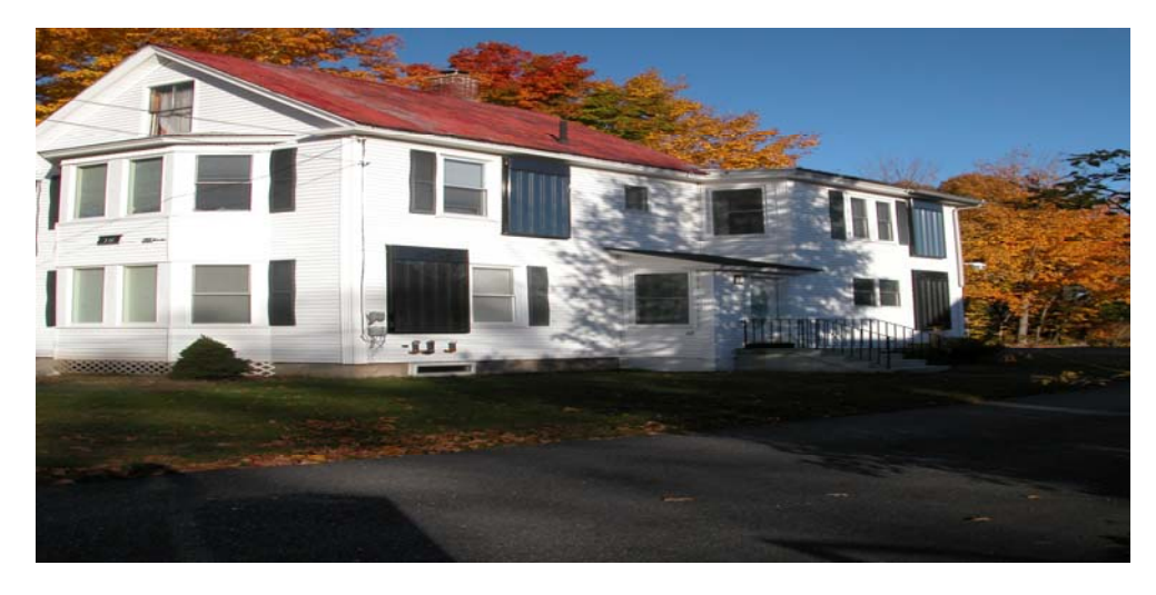
Solar thermal hot-air system, South Paris Maine