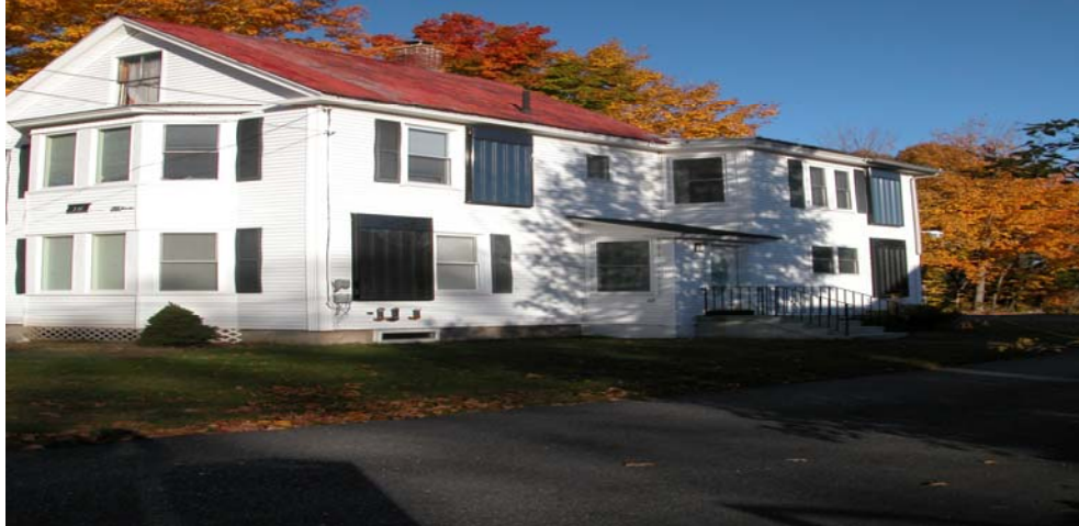
Solar thermal hot-air system, South Paris Maine