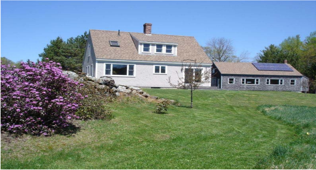
Solar electric system (2.38 kW), Hope ME. Installed by Energyworks of Liberty