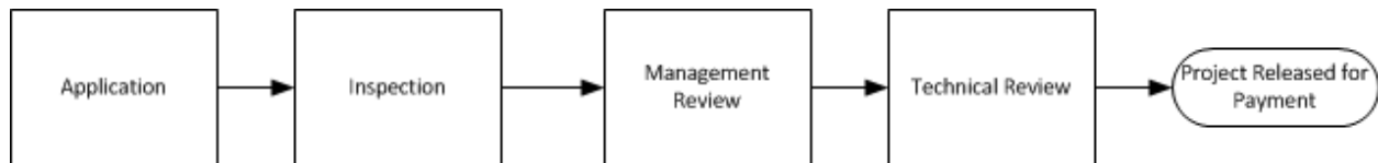
FIGURE 1 – EFFRT 2.0 WORKFLOW

The effRT 2.0 application is used to manage projects from the project inception to final payment. The Application workflow step is used to collect all information about the project including customer information, premise information, and measures installed. After the project is completed, it is subject to inspection. The Inspection workflow step collects results from the inspection. The Management Review workflow step is used by the Delivery Team to review the project for accuracy. During Management Review, program administrators will determine if a Technical Review is required. The Management Review also ensures that the latest savings and factor schedules are being referenced for savings calculations. If it is not, a technical review will automatically kick-off. The Technical Review workflow step allows engineers to review and update measure information based on review results. Upon completion of the workflow, the project will be released for payment.