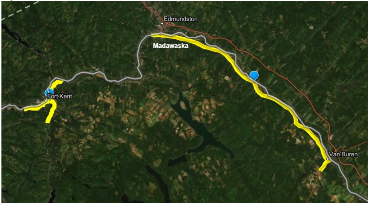
Segments 1 & 2

Yellow highlighted sections indicate eligible segments on which bids will be accepted. The color of the map pins indicates the tier of the site. Blue = Tier 1, Purple = Tier 2, Orange = Tier 3.