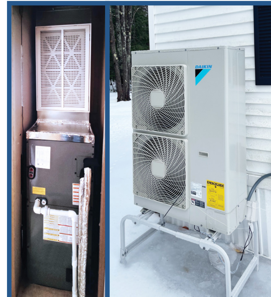
Example Indoor and Outdoor Units

Homeowners must contribute to the cost of the project. They have the option of paying $2,000 toward the project up front, or can finance the required project contribution with a loan offered by Efficiency Maine. See efficiencymaine.com for details.