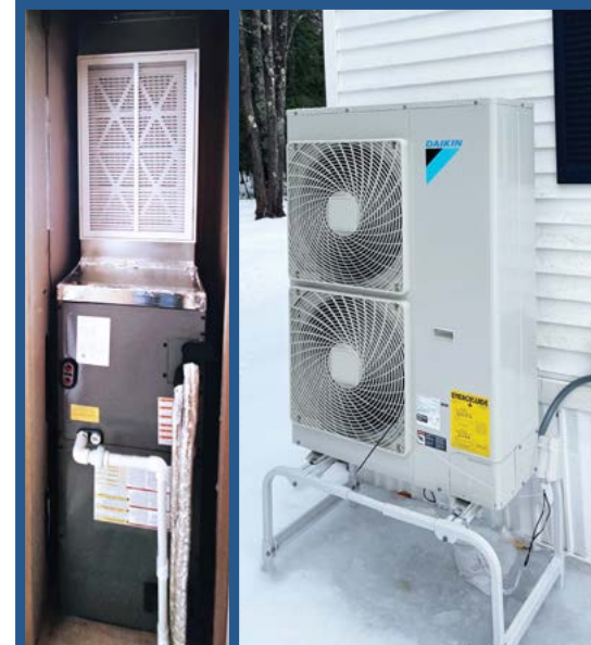
Example Indoor and Outdoor Units

Homeowners must contribute to the cost of the project. They have the option of paying $2,000 toward the project up front, or can finance the required project contribution with a loan offered by Efficiency Maine. See efficiencymaine.com for details.